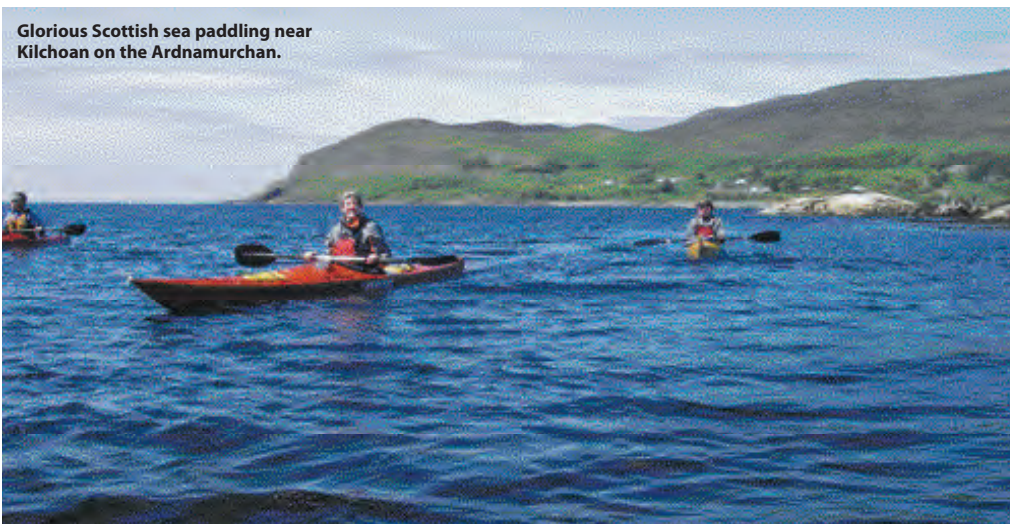
Glorious Scottish sea paddling near Kilchoan on the Ardnamurchan.