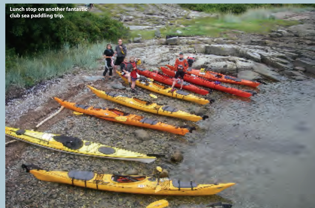
Lunch stop on another fantastic club sea paddling trip.