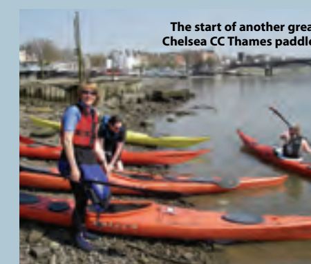
The start of another great Chelsea CC Thames paddle.