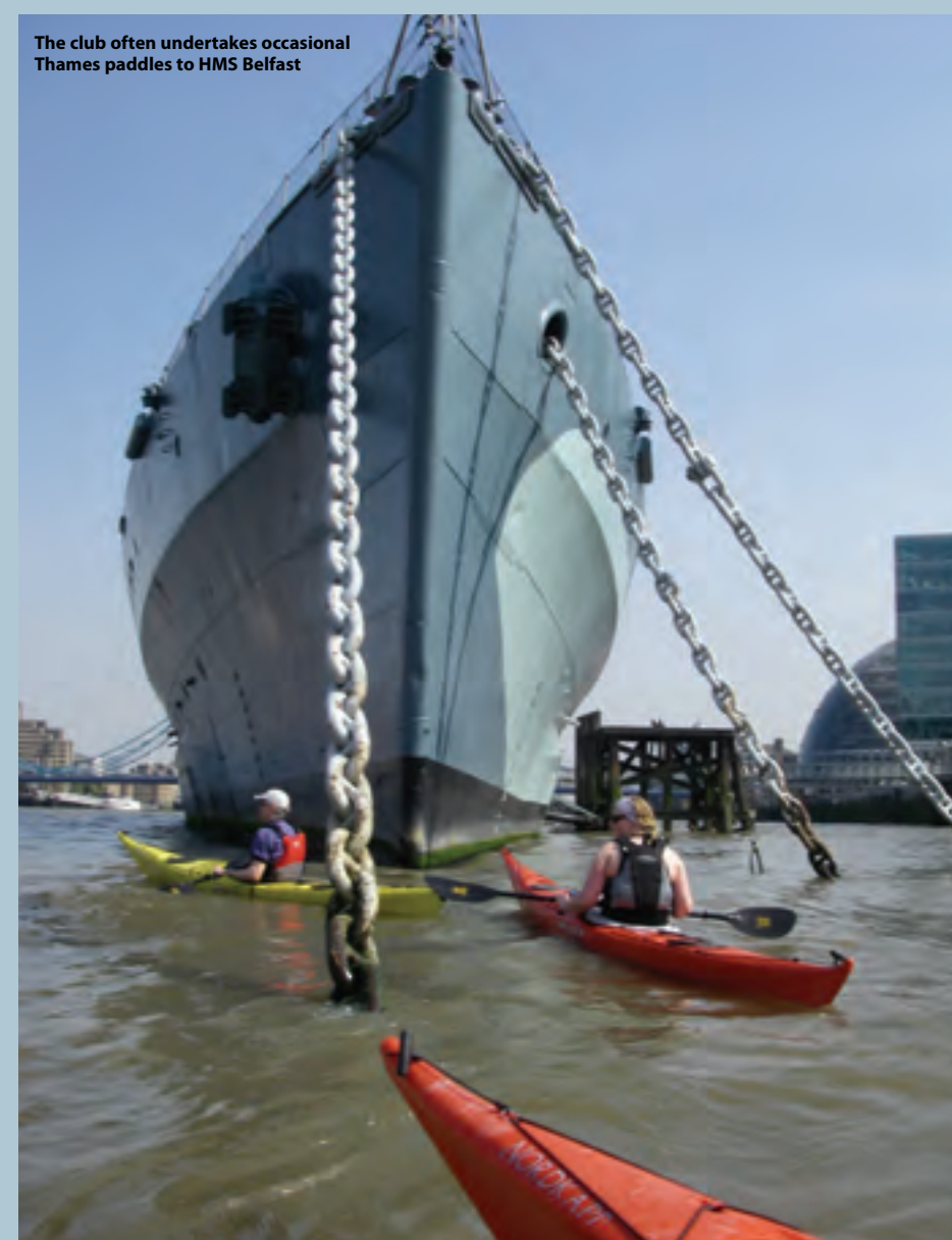
The club often undertakes occasional Thames paddles to HMS Belfast