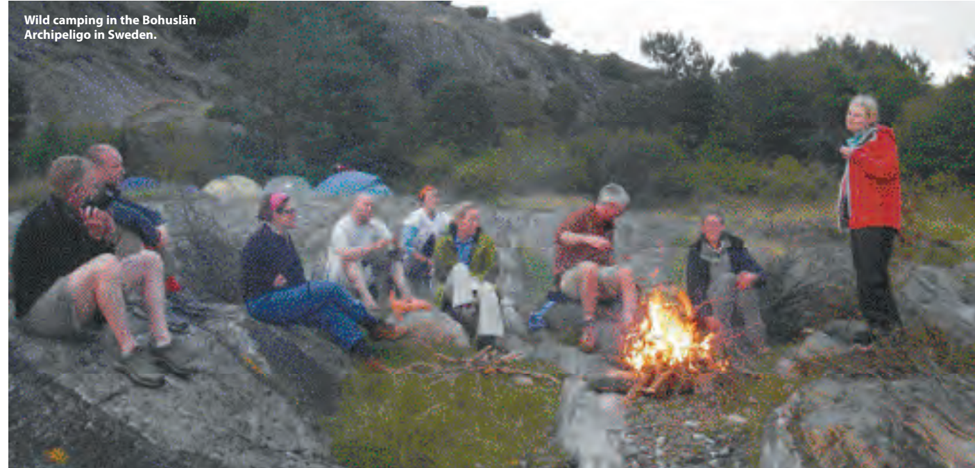
Wild camping in the Bohuslän Archipelago in Sweden.