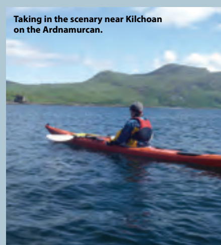
Taking in the scenery near Kilchoan on the Ardnamurchan.